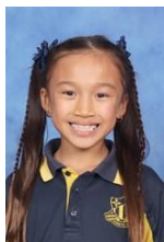
Ally N 4H

Congratulations to the following students who recently received their Gold Awards: