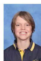
Angus D 6S